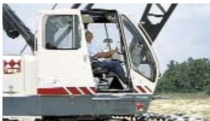
Environmental operator's cab