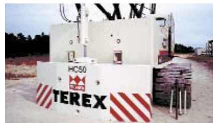
Hydraulic removable counterweight system