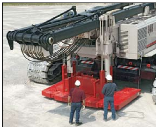
Counterweight removal mechanism self-removes for even lower main load transport weight where required.