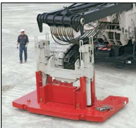
Counterweight removal mechanism detached