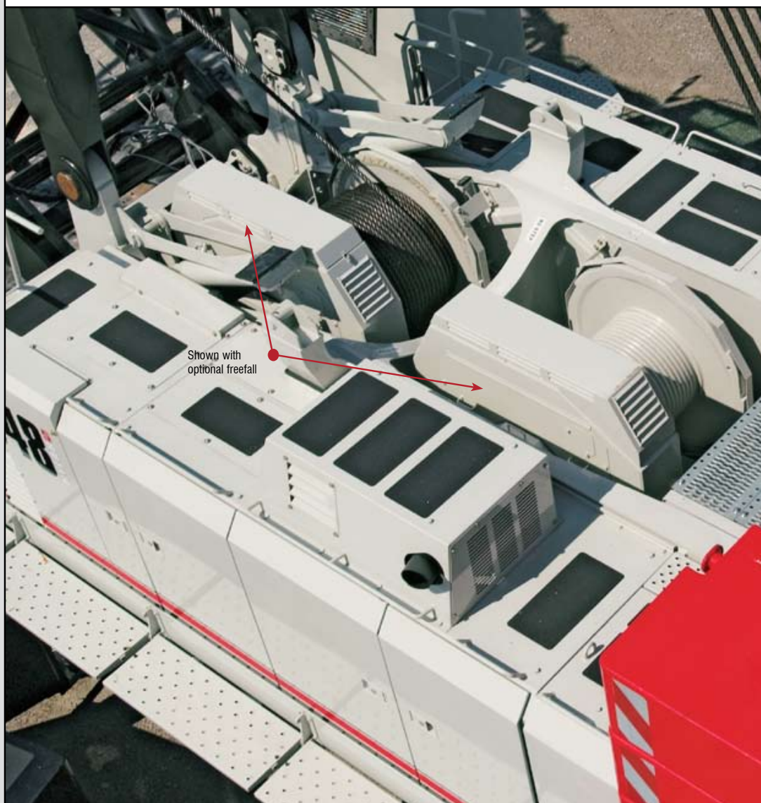
Shown with optional freefall