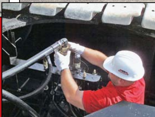
Crawler quick disconnects can attach in minutes — no tools required