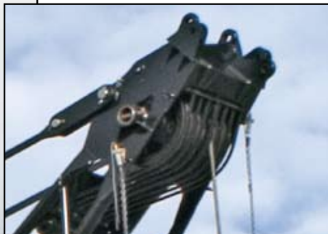
Long range tip