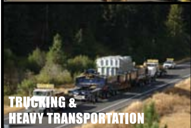
TRUCKING & HEAVY TRANSPORTATION