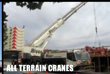
ALL TERRAIN CRANES