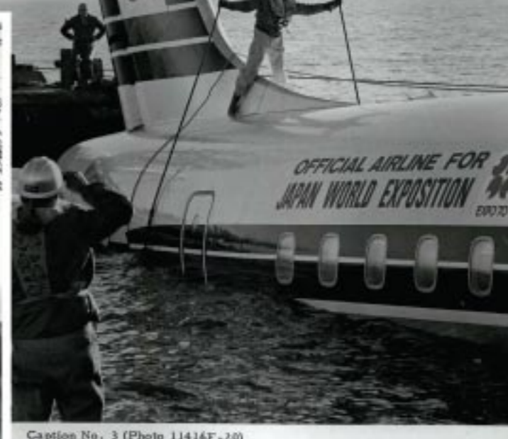
Caption No. 3 (Photo 11416F-20) The third lift point was immediately forward of the tail assembly. Bigge riggers adjust where ailing and through impossible wet the base of the San Mateo bridge shows, which Shiga barely cleared by the narrowest.