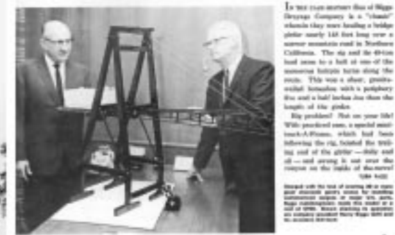
Advertising Mobile engineering ad in Dana Digest