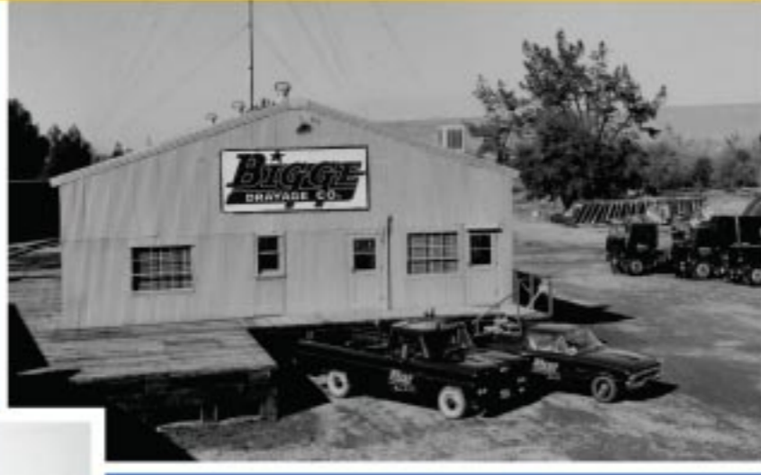
Bigge Terminal Bigge yard and office located in Oroville, CA