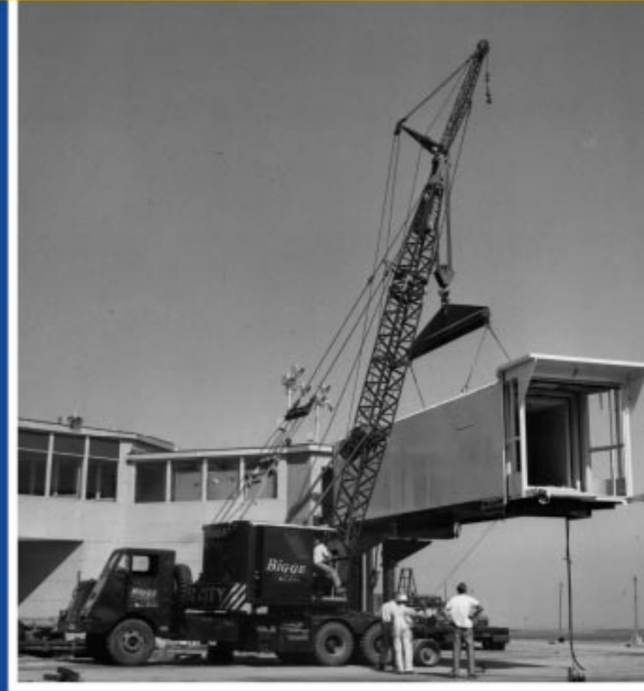
S.F. International Airport Hauling and erecting jetways for Pacific Iron & Steel Corp.