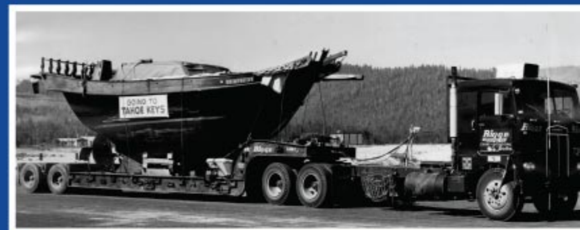
Bay Area Hauling Chinese Junk to Lake Tahoe