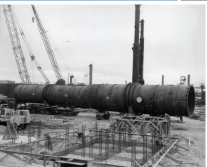
1962 Tidewater Oil Vessel move to Tidewater Oil, Avon