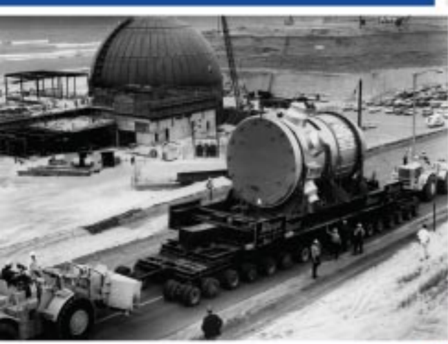
Westinghouse Reactor Reactor move – San Onofre, CA