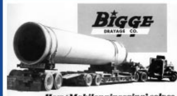
How 'Moblengineering' solves super-size hauling-rigging problems