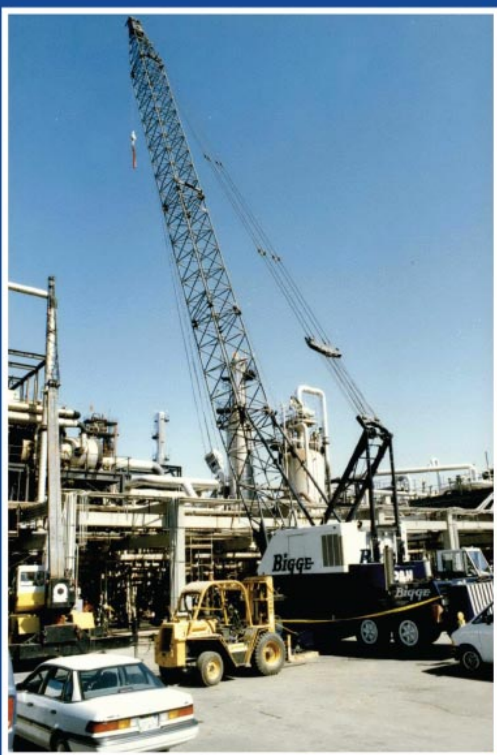
Tosco Avon Refinery