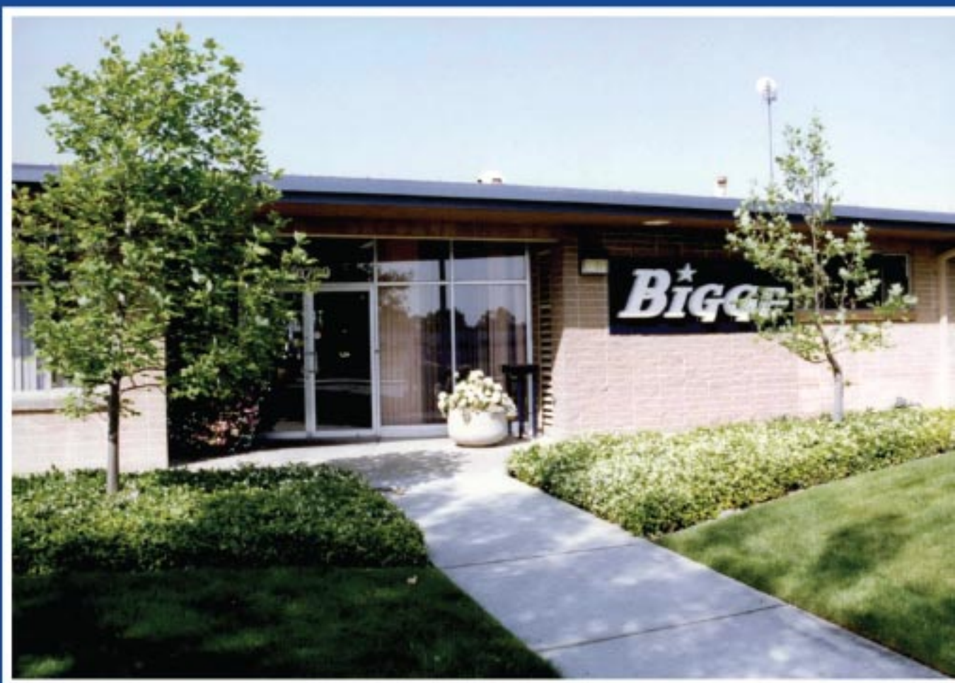
Bigge San Leandro Office