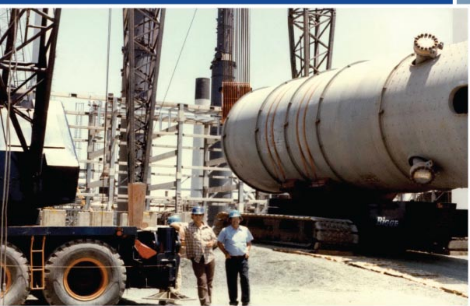
Tosco Avon Refinery 200-ton tower lift