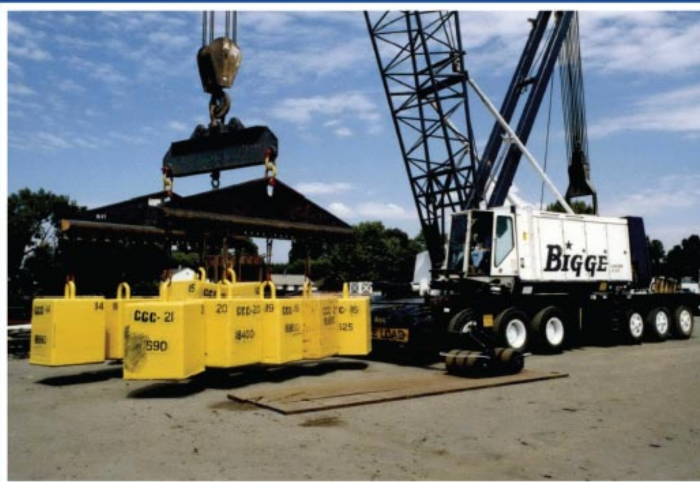
New HC268 Walking Wheels