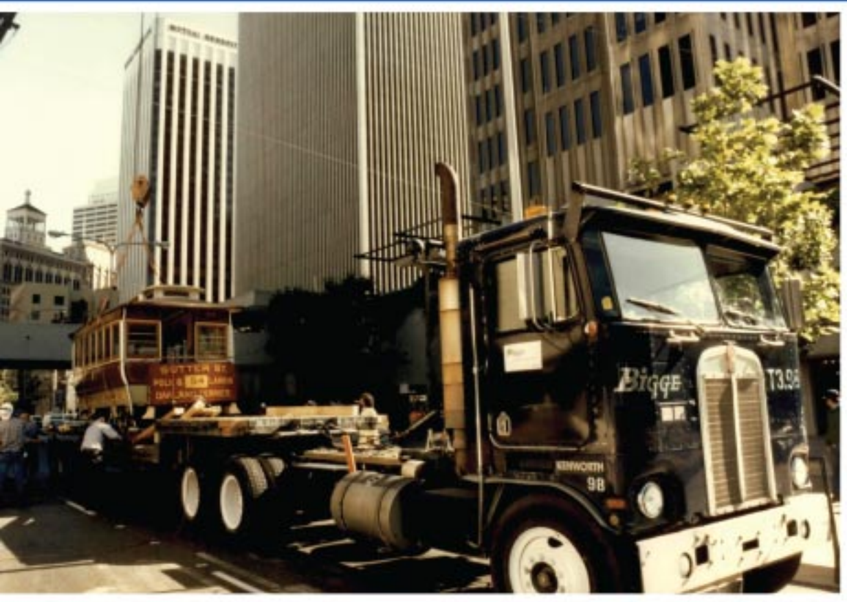
Cable Car Haul San Francisco, CA