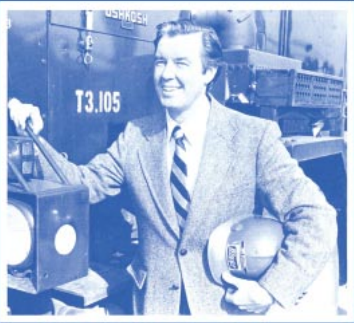
The Biggevent Bigge Newsletter April, 1981 edition

Published by the BIGGE GROUP • 10700 Bigge Street • San Leandro, California 94577 • USA