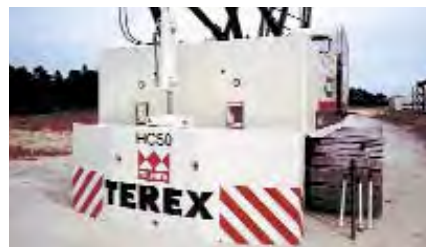
Hydraulic removable counterweight system