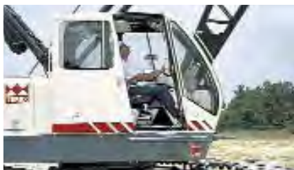
Environmental operator's cab

Max. Lifting Capacity: 50 tons (45.4 mt)