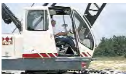
Environmental operator's cab