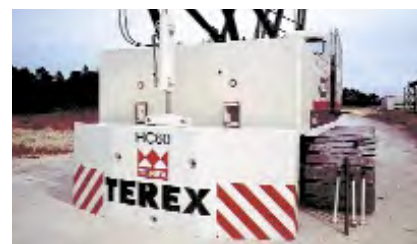
Hydraulic removable counterweight system